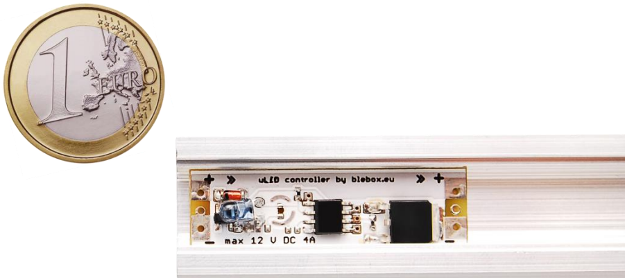
Fig. 1 – device installed in LED profile - 1 euro coin only for size comparison

Twilight Switch is the world's smallest twilight LED controller for usage in LED application, e.g. in commerce, industrial and home lighting, ambient lighting, automotive industry, emergency lighting, assisted living solutions, etc.